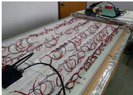
Figure 1. The TE device is attached behind the PV module

The thermal photovoltaic hybrid system consists of air collectors and TE modules. The system has been installed and designed at the Solar Energy Research Institute, UKM (Malaysia). The type of PV panel is mono-crystalline silicon solar cells with a total area of 0.52m 2 each. The residual heat absorbed by air collectors can be used to develop a PV-TE hybrid module by affixing the TE device behind the PV module as shown in Figure 1.