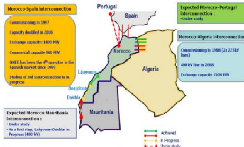
Figure 2. Strengthening and development of the energy interconnection with neighboring countries [13].

To ensure continuity of electricity supply, the Moroccan network is reinforced by interconnections with neighboring countries, thereby guaranteeing the reliability of supply, security, and the mutual stability of all networks. These interconnections can also increase the maximum capacity of the electrical energy. It also develops the technical and economic exploitation of the energy of the production and transport systems of the interconnected countries. Currently, Morocco has two interconnections with Spain and Algeria. These interconnections will be reinforced by doubling the capacity of the new lines and the other interconnections with Portugal and Mauritania are under consideration. The strengthening and development of energy interconnections with neighboring countries is illustrated in Figure 2 [13].